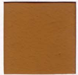
Arizona Sunrise - RA15