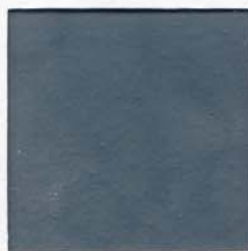
Smokey Blue - RA27