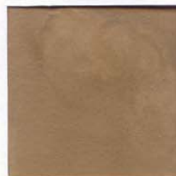
New Desert Tan