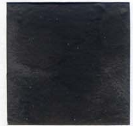
Military Gray - RA25