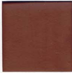
Brick Red - RA08