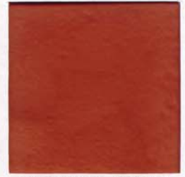
Baja Red - RA10