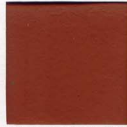
Farmhouse Red - RA09