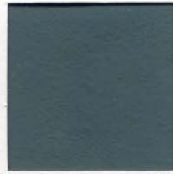
Gun Metal Green - RA04