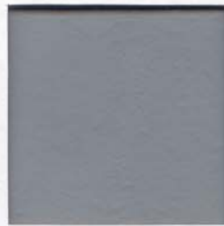
Sun Gray - RA23