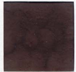
Black Coffee - RA20