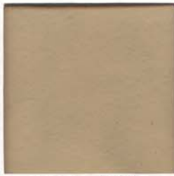
Peach - RA02