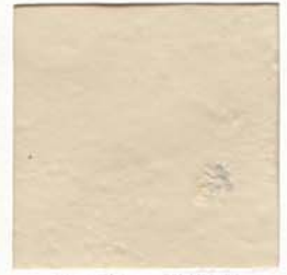
Vanilla - RA05