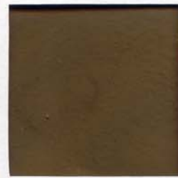
Coffee & Cream - RA14