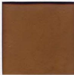
Terracotta - RA17