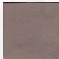
Stone Mauve - RA29