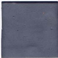
New Blue 2000