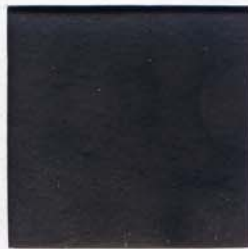
Lilith Charcoal - RA22