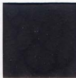
Black - RA28