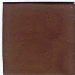
Autumn Brown - RA16