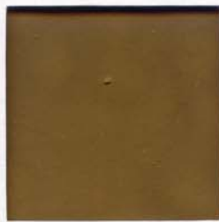
Desert Tan - RA12