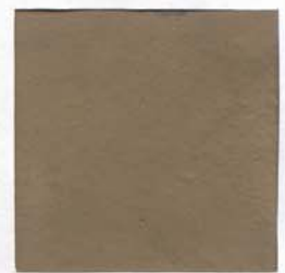
Sand Stone - RA30