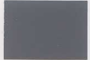
R13 Deep Charcoal