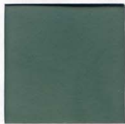
Forest Green - RA11