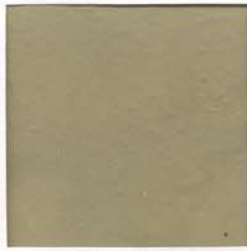
Adobe - RA03