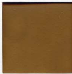
Frappuccino - RA13