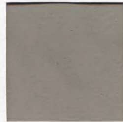
French Gray - RA24