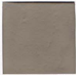
Peanut Butter - RA01

Note: Color selections on this chart approximate as closely as possible the appearance of the coloured release agent. Variations can be expected due to job conditions, finishing techniques, use of sealers and slight raw material color drifts.